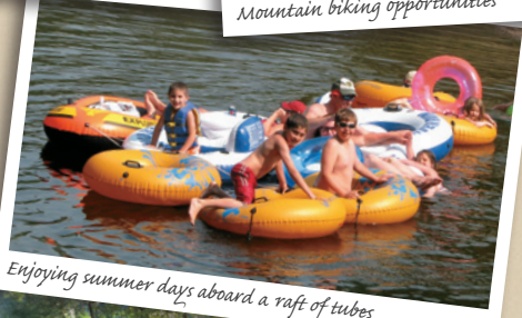
Enjoying summer days aboard a raft of tubes