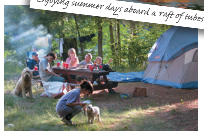
Gathering in the beautiful Adirondack Park