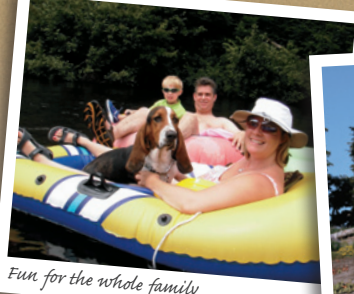
Fun for the whole family