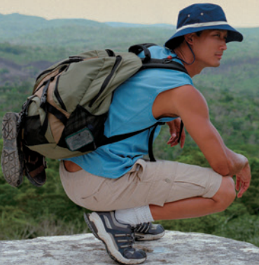
Hike century-old wilderness trails

Cabins, Luxury R/Vs, Canoes, Kayaks & Tubes