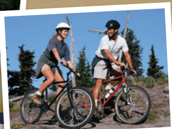
Mountain biking opportunities