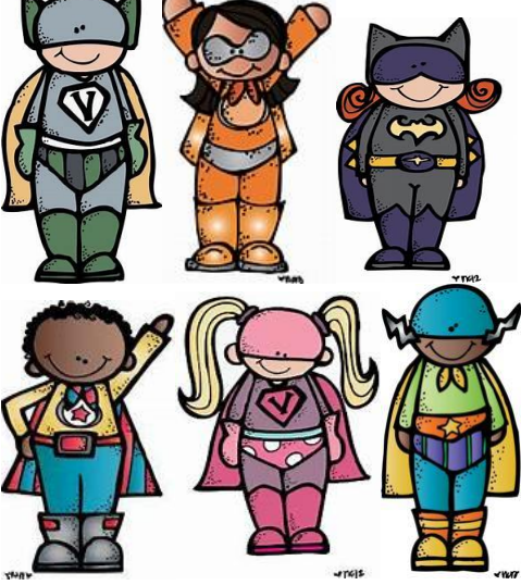
August 16 – 18 Superhero Weekend

Note: All activities, events & bands are subject to change at any time